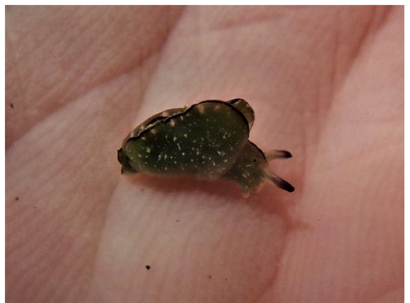
Elysia coodgensis (MVD) - 2 sightings