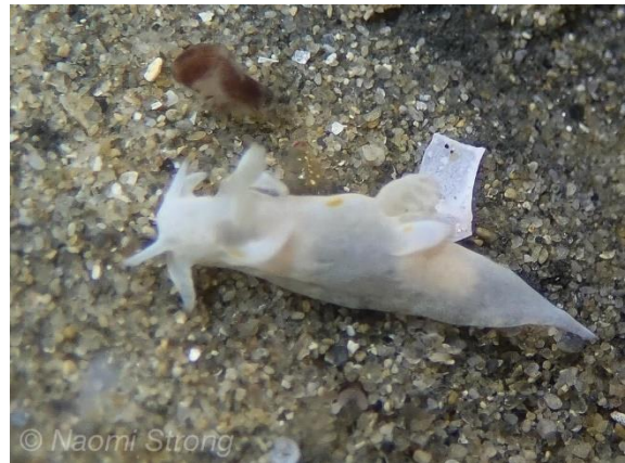
Trapania aureopunctata (NaS) – 1 sighting