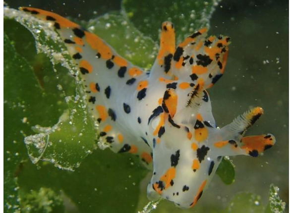
Thecacera pennigera (JW) - 5 sightings