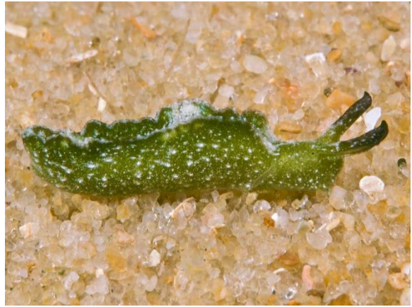
Elysia sp.(RL&CH) - 1 sighting