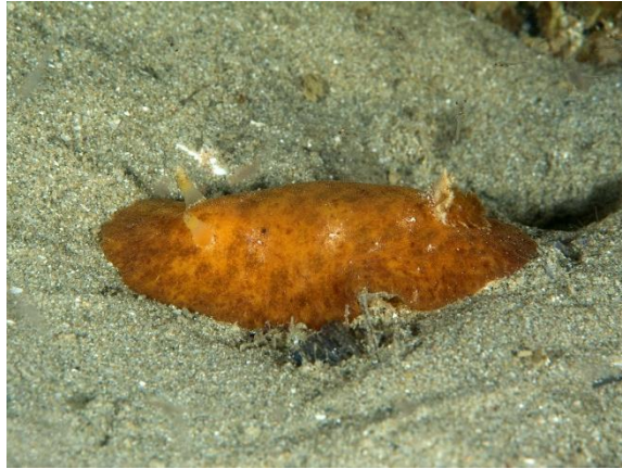
Discodoris sp.(RL&CH) - 1 sighting