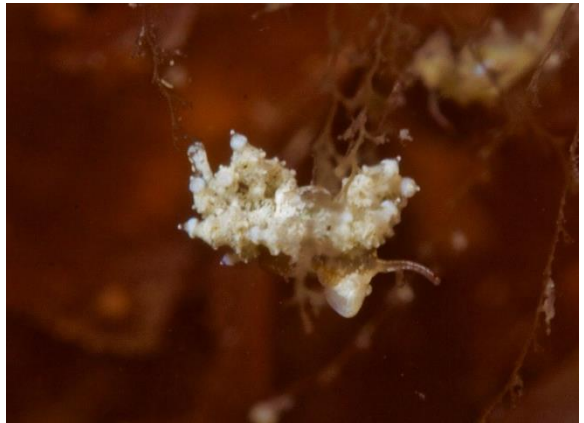
Eubranchus sp. 2 (RL&CH) – 1 sighting