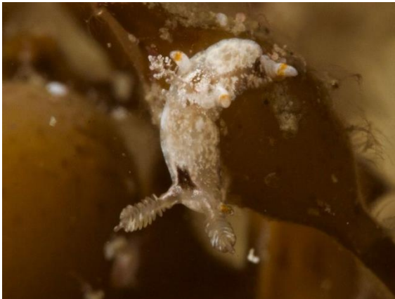
Ancula sp. [RB2] (RL&CH) – 1 sighting