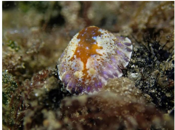
Chromodoris alternata (NaS) - 2 sightings