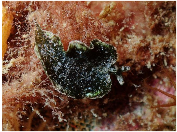
Elysia maoria (JB) – 3 sightings