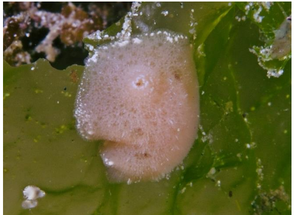
Jorunna crawfordi (RL&CH) – 2 sightings