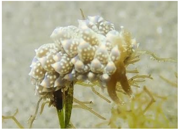
Baeolidia australis (NaS) – 1 sighting