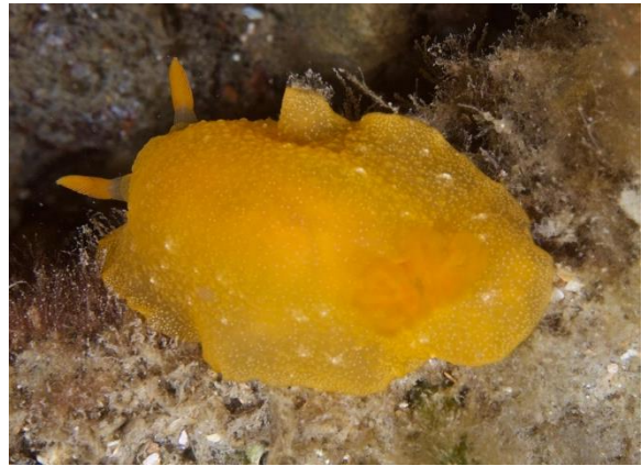
Dendrodoris aurea (RL&CH) – 1 sighting