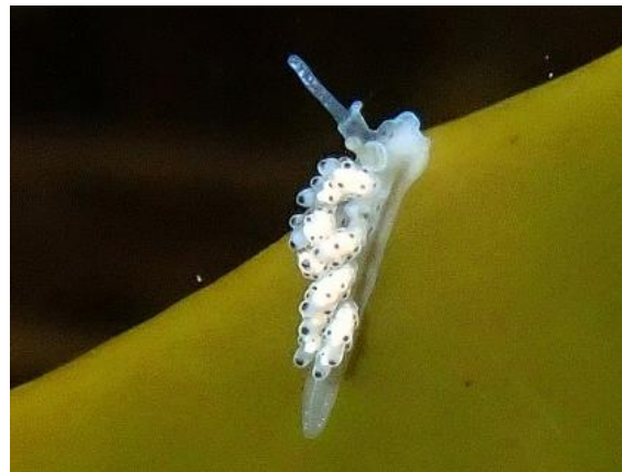
Doto ostenta (NiS) – 1 sighting