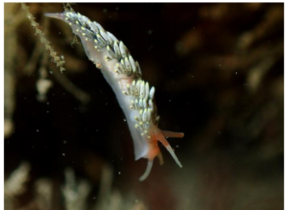
Trinchesia catachroma (JB) – 4 sightings