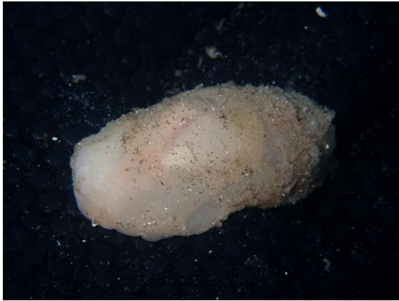
Philine angasi (NiS) – 1 sighting