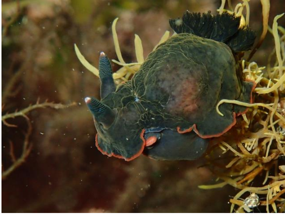
Dendrodoris arborescens (JB) - 2 sightings