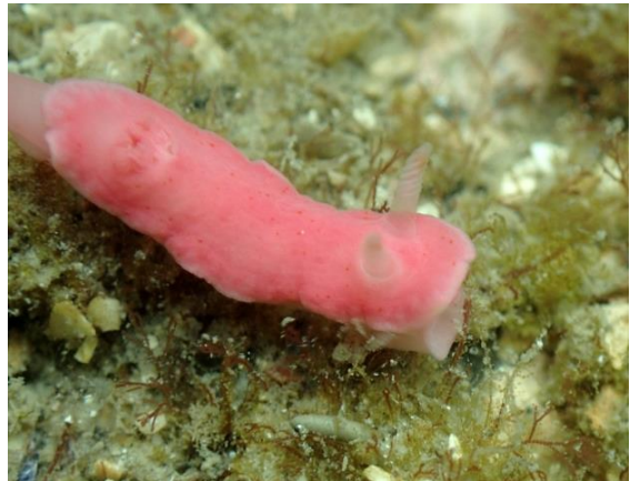
Verconia haliclona (JMCS) – 3 sightings