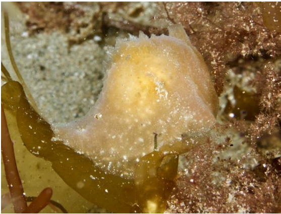
Lamellaria sp. (RL&CH) – 1 sighting