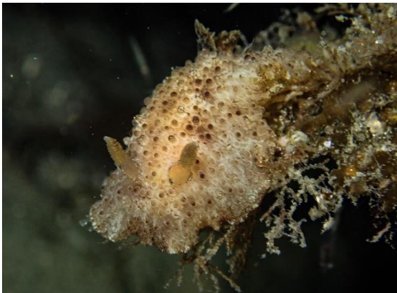
Hoplodoris nodulosa (NaS) - 2 sightings