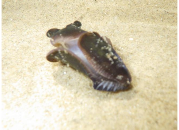
Tubulophilinopsis lineolatus (NM) – 1 sighting