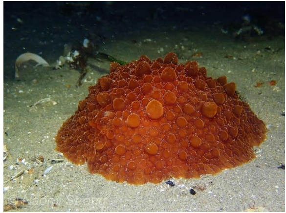
Pleurobranchus hilli (NaS) - 4 sightings