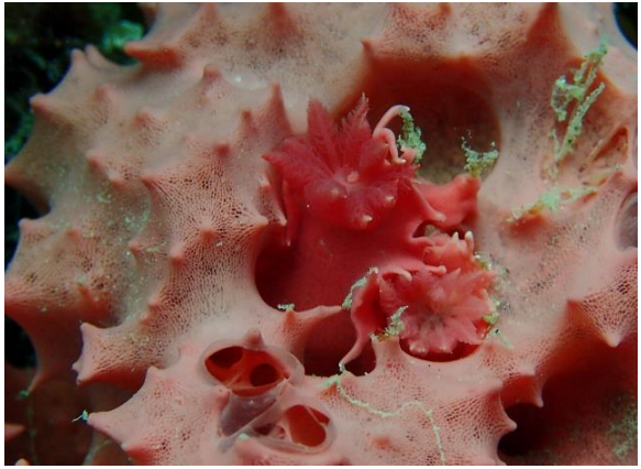
Verconia verconis (JB) – 1 sighting