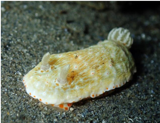
Goniobranchus epicurius (JB) – 3 sightings