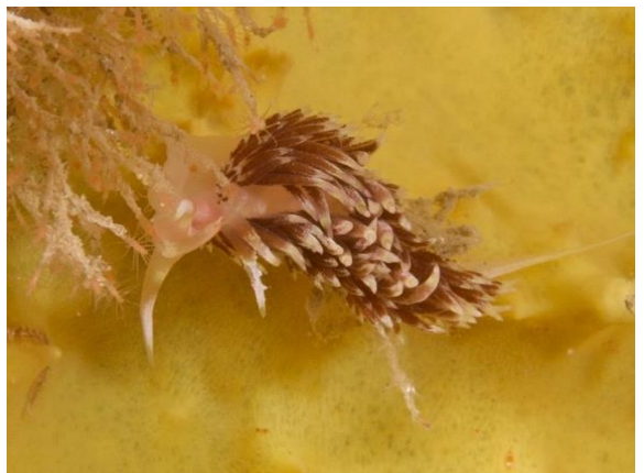
Facelina hartleyi (RL&CH) - 1 sightings