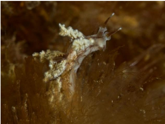
Doto cf. pita (RL&CH) – 1 sighting