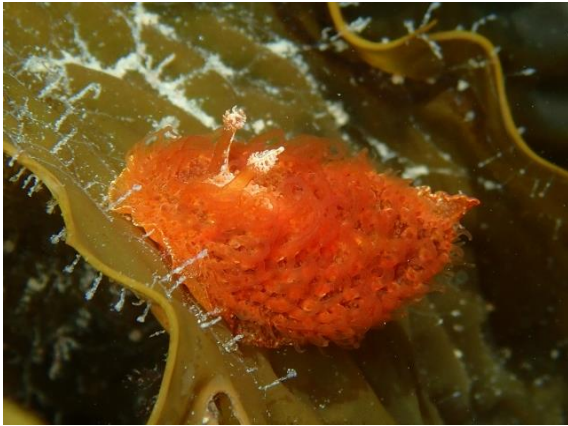
Madrella sanguinea (NiS) – 1 sighting