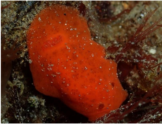
Discodoris paroa (JB) – 4 sightings