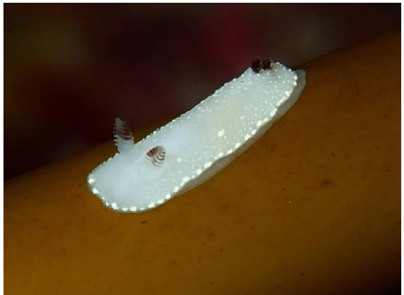
? Cadlina sp. (NiS) – 1 sighting