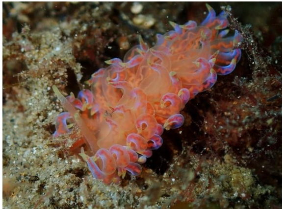
Phyllodesmium serratum (JB) – 1 sighting