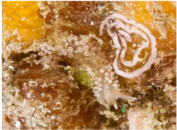
Anteaeolidiella lurana (RL&CH) – 1 sighting