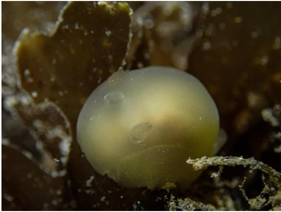
Hallaxa sp. (NaS) - 1 sighting