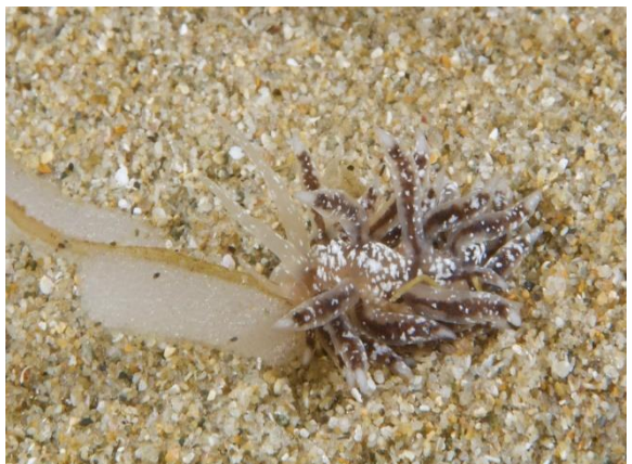
? Cumanotus sp. (RL&CH) - 2 sightings