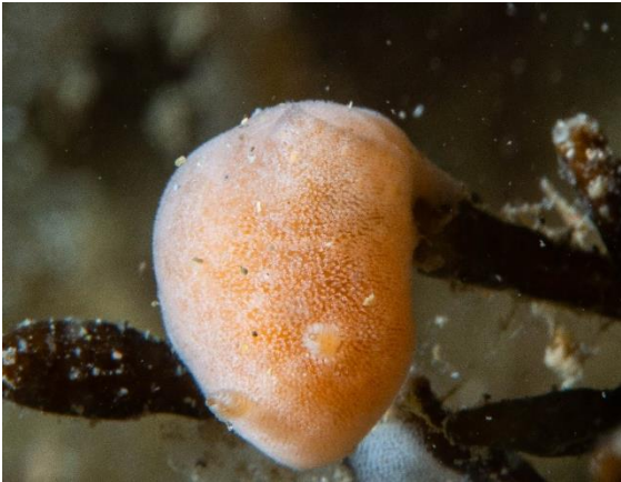
Jorunna sp. (RL&CH) - 1 sighting