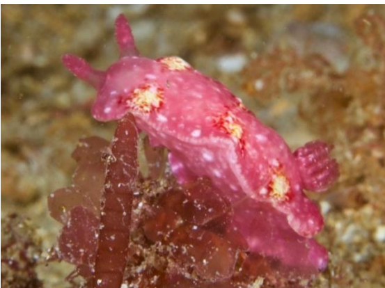
Thorunna arbuta (RL&CH) – 1 sighting