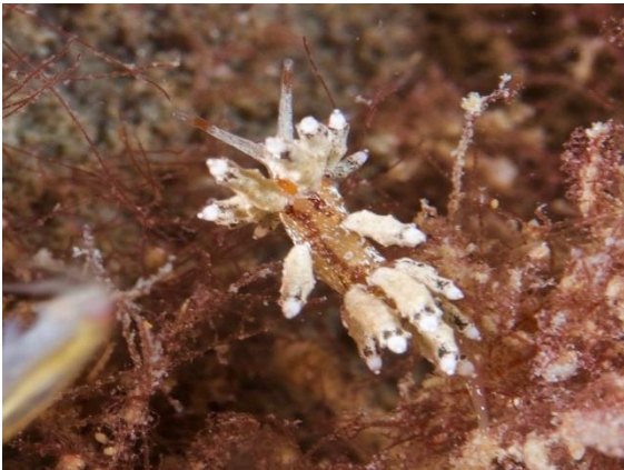
Eubranchus sp. 1 (RL&CH) – 1 sighting