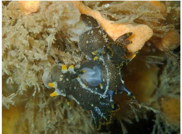
Polycera hedgpethi (NiS) – 6 sightings