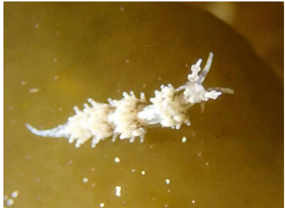
Favorinus sp. [RB1] (NiS) - 2 sightings