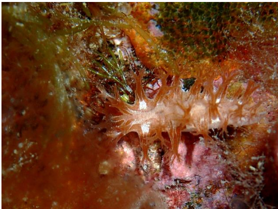
Tritonia sp. (JB) – 1 sighting