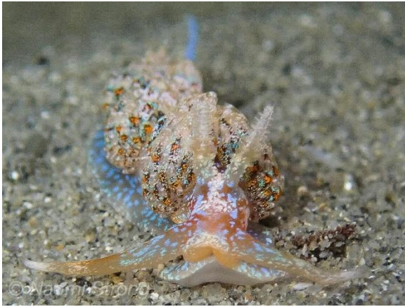
Austreaolis ornata (NaS) - 3 sightings