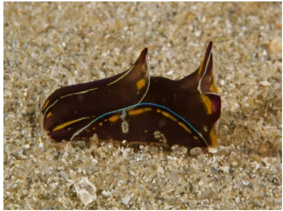
Philinopsis speciosa (RL&CH) - 3 sightings