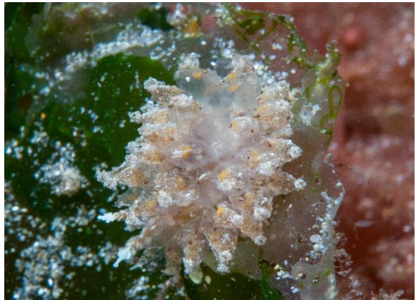
Janolus sp. (RL&CH) – 1 sighting