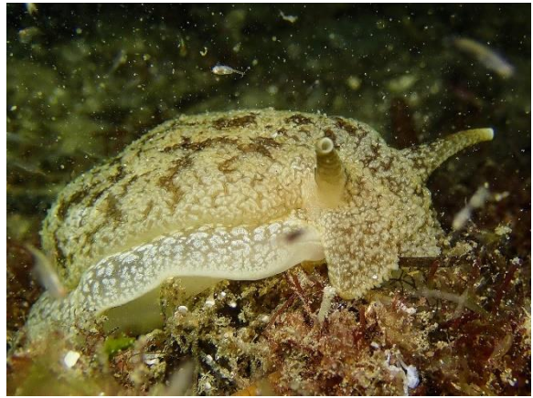
Pleurobranchaea maculata (NaS) - 1 sighting