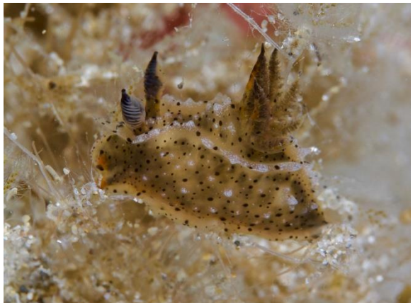
Polycera melanosticta (RL&CH) – 1 sighting