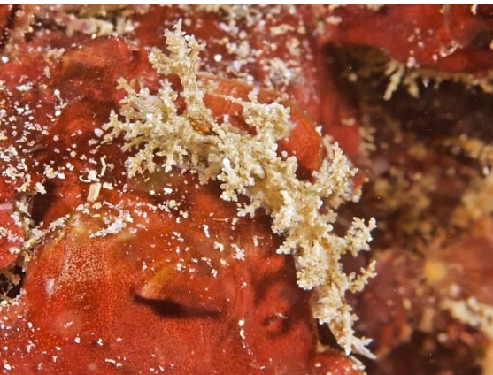
Dendronotus sp. (RL&CH) – 1 sighting