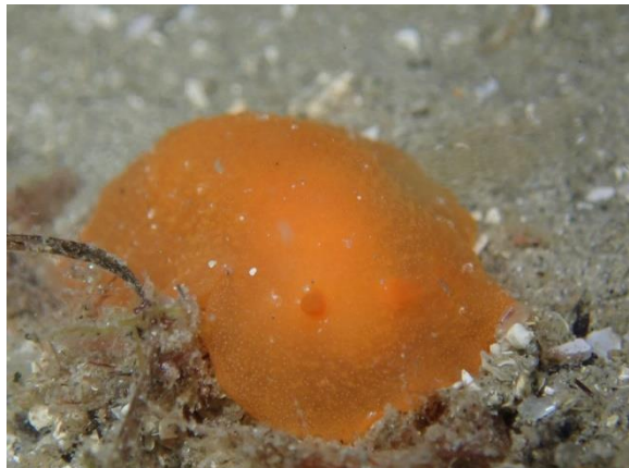
Doriopsilla carneola (NaS) – 3 sightings