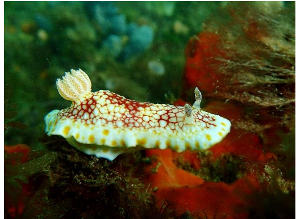
Goniobranchus tinctorius (JB) - 2 sightings