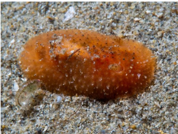
Doris cameroni (RL&CH) - 2 sightings