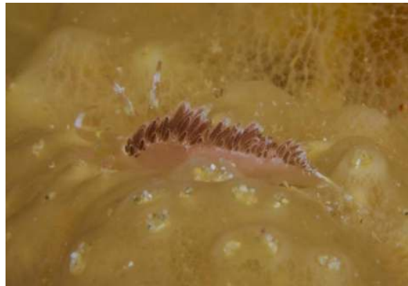
Facelina sp. [RB] (RL&CH) – 1 sighting