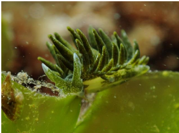
Placida sp. (JB) – 1 sighting