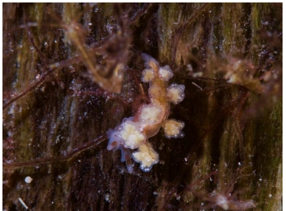
Doto pita (RL&CH) – 1 sighting