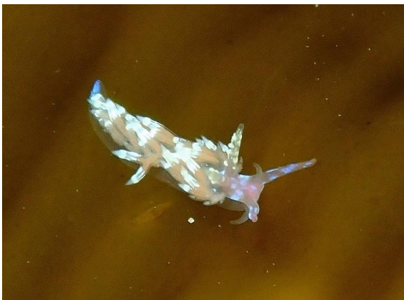
Trinchesia thelmae (NiS) - 2 sightings