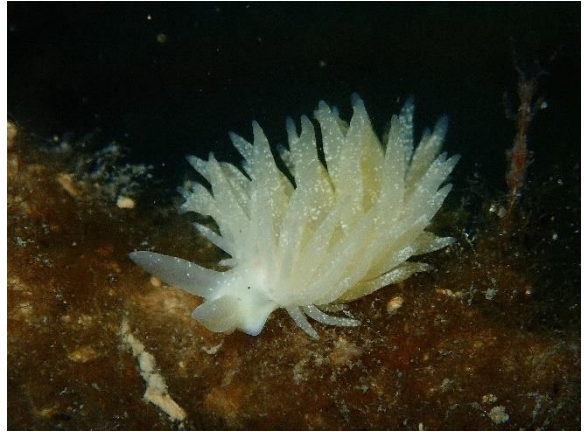
Hermaea sp.(NiS) - 1 sighting