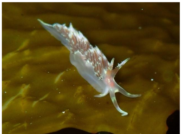
Trinchesia scintillans (NiS) - 1 sightings