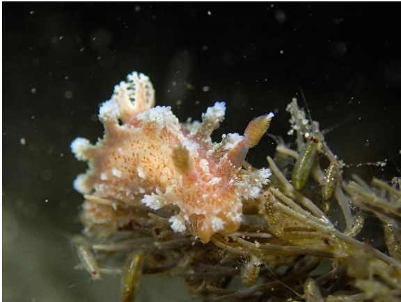
Kaloplocamus ramosus (NaS) - 2 sightings