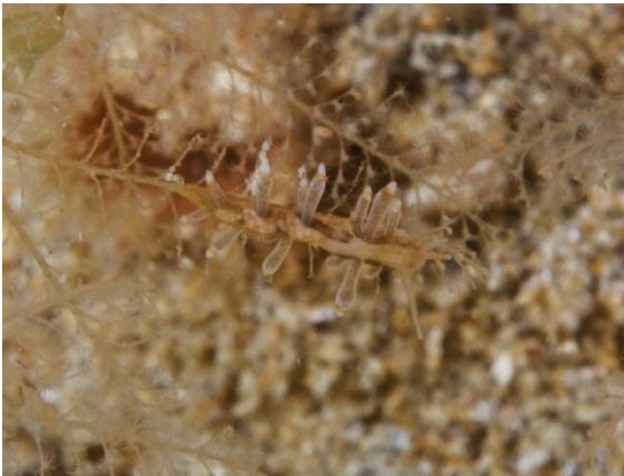
Eubranchus sp. 3 (RL&CH) – 1 sighting