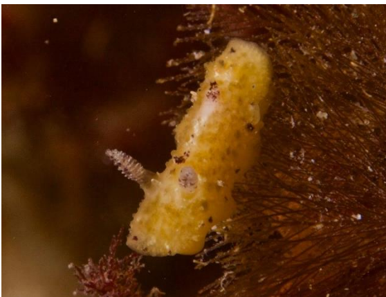
Doris immonda (RL&CH) - 1 sighting