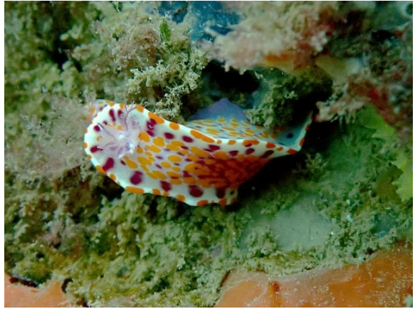
Ceratosoma amoenum (JB) - 1 sighting