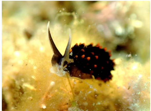
Ercolania boodlea (JB) – 5 sightings