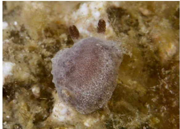
Dorid. sp. (RL&CH) – 1 sighting