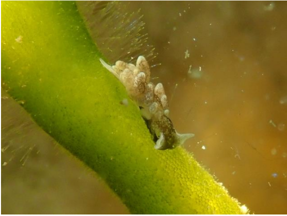
Ercolania sp. (NiS) - 1 sighting