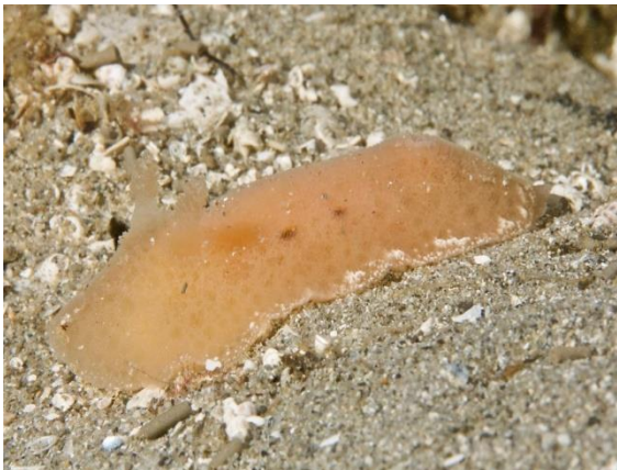
Jorunna pantherina (RL&CH) – 1 sighting