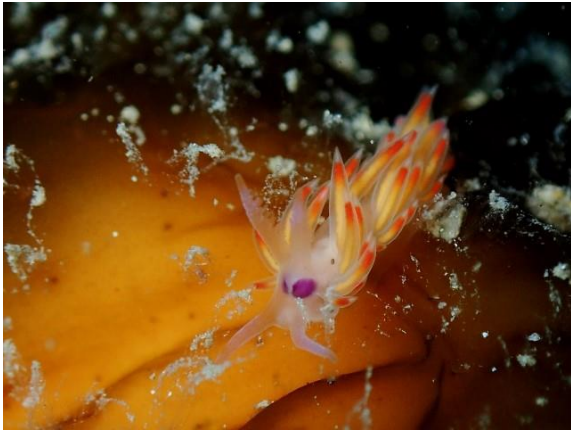
Flabellina poenicia (JB) - 2 sightings