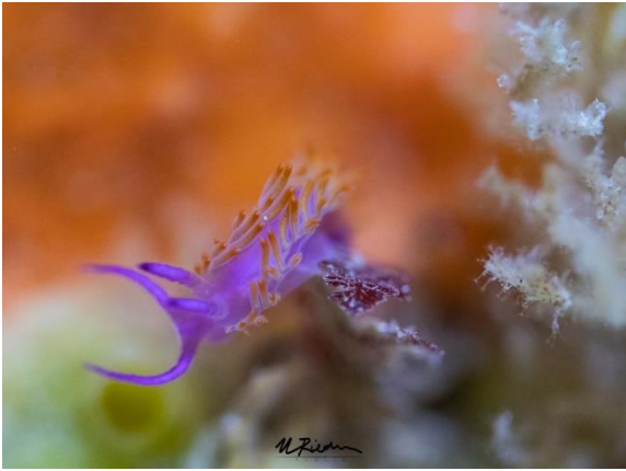
Flabellina sp. (MR) - 7 sightings