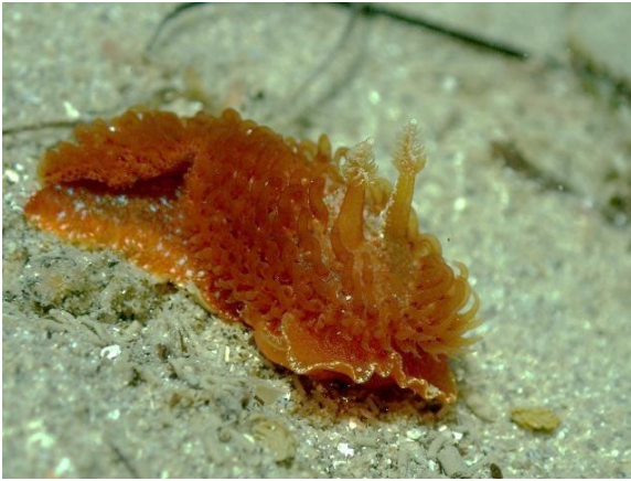
Madrella sanguinea (JB) - 4 sightings