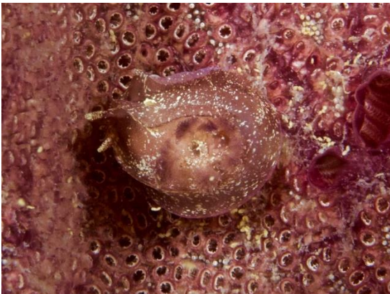
Goniodoris meracula (RL&CH) – 1 sighting