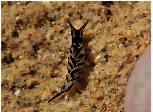
Ercolania margaritae (MVD) – 1 sighting