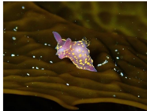
Polycera janjukia (NiS) – 4 sightings