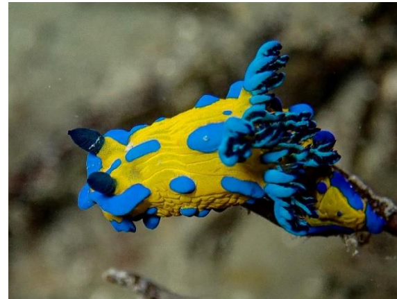
Tambja verconis (NaS) – 5 sightings