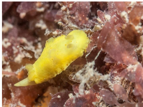
Verconia closeorum (RP) - 2 sightings