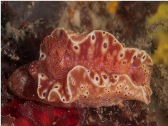
Ceratosoma brevicaudatum (RP) – 5 sightings