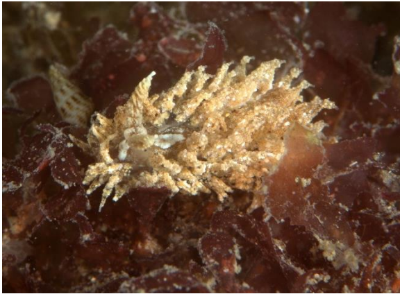
Janolus hyalinus (IS) – 1 sighting