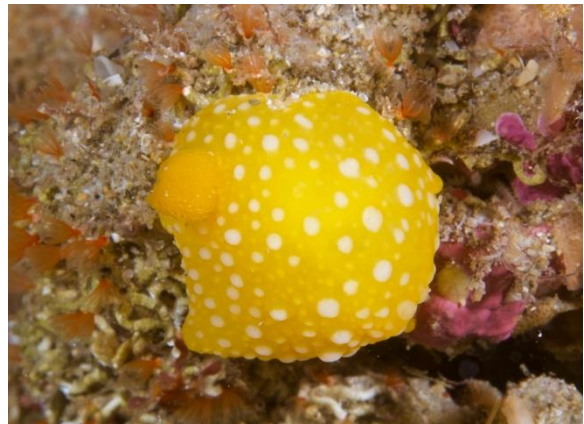
Doris chrysothorax (RL&CH) – 1 sighting