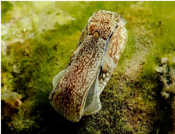
Philinopsis taronga (JB) – 3 sightings