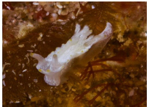
Goniodoridella savignyi (RL&CH) - 1 sighting