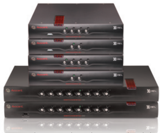
SwitchView SC100 and SC200 switching solutions provide with three layers of tamperproof hardware security. The SC200 switches ad CAC support at the desktop.

The SwitchView SC100 and SC200 switches offer support for USB and/or PS/2 peripherals and target computers.