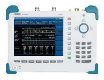
CellAdvisor RF Analyzer