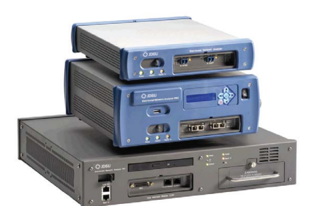
Distributed Network Analyzer

The Xgig Secure System chassis is a high-performance distributed monitoring, analysis, and protocol testing system with removable storage that addresses the extensive security needs of primary contractors and government facilities. This addition to the Xgig family uses standard Xgig blades and software to provide flexible, comprehensive testing and verification of components, nodes, and switches for Fibre Channel, Gigabit Ethernet, and SAS/SATA protocols.