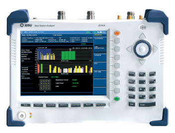
CellAdvisor Base Station Analyzer