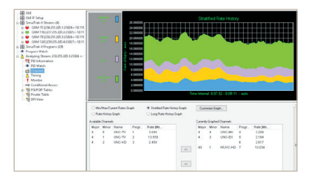
Video Stream Analyzer