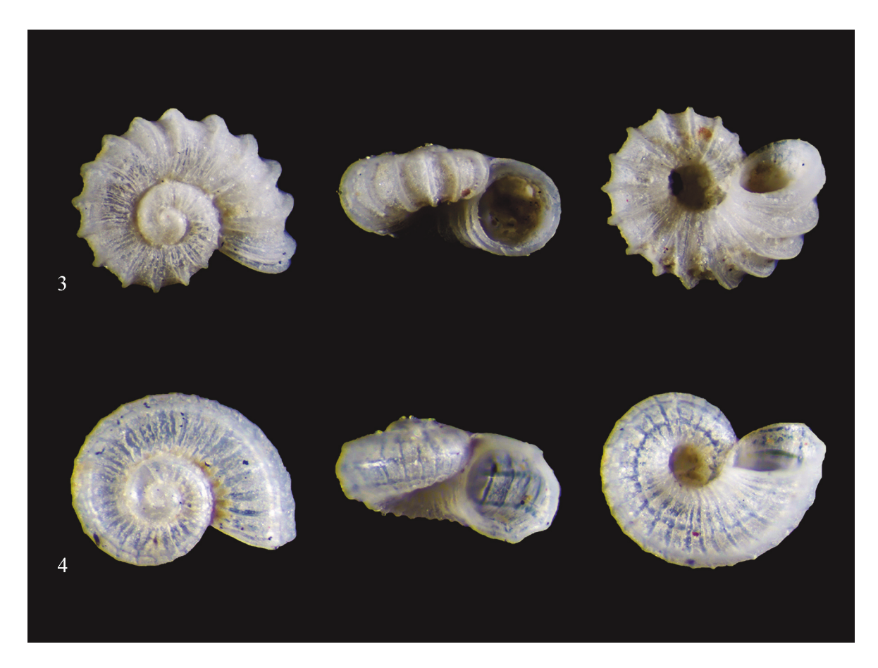
Figure 3. Skeneoides formosissima (mm 1.03), Favignana Island (Trapani, Sicily, Italy) 34 m (WR). Figure 4. Skeneoides exilissima (mm 1), Scilla (Reggio Calabria, Calabria, Italy) 35 m (WR).

nomen novum, but simply as a proposal for a name for a species not yet described. Based on this, it is clear that such this name is a nomen nudum, lacking any description or indication (Art. 12 of the Code, ICZN 1999), hence unavailable.