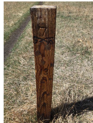
Signposts along the 7th Cavalry Trail System

Funding that was collected from the SRP fee program was used to purchase new 6"x6" trail marker posts. These posts replace old carsonite signs often damaged by cattle along the trails. The permanent signposts, once installed, will provide trail information such as trail name, current lat/long, and mileage information. Of the $4,645 collected from Special Recreation Permits in FY 21, $2,520 was put back into the trails system.