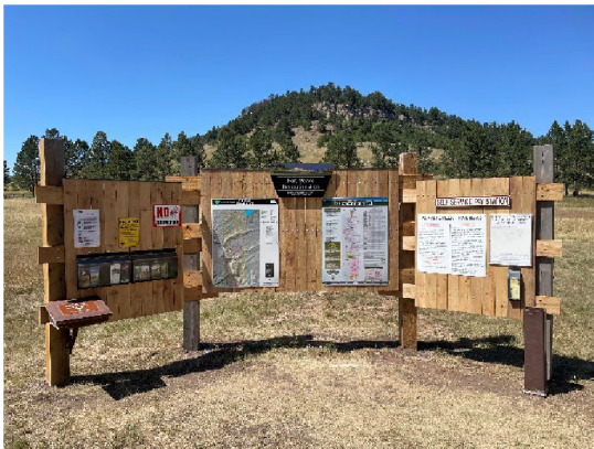
Kiosk at Alkali Creek Campground and Trailhead

At the Alkali Creek Campground and Trailhead, a portion of the fees was utilized to construct a new kiosk that provides the public information on the area's attractions, trail system, and campgrounds. The project combined information into one location for better visibility by the public. Funding was used to maintain the campground 21 sites, vault toilet, and potable water system. Of the $5,001 collected in FY 21, $2,105 was put back into improvements.