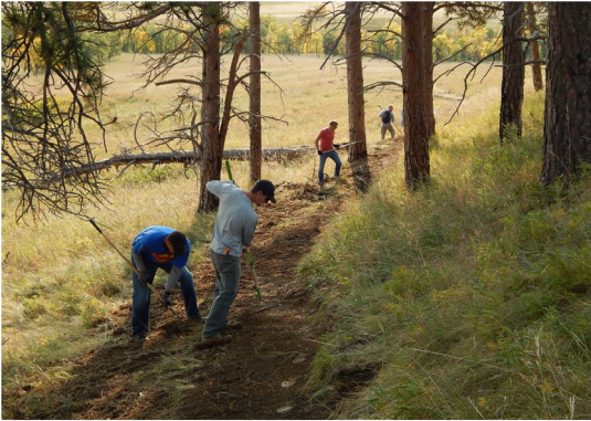
Trail work at Fort Meade

In FY22, the continued maintenance of the Fort Meade Recreation Area will occur along with the following improvements: