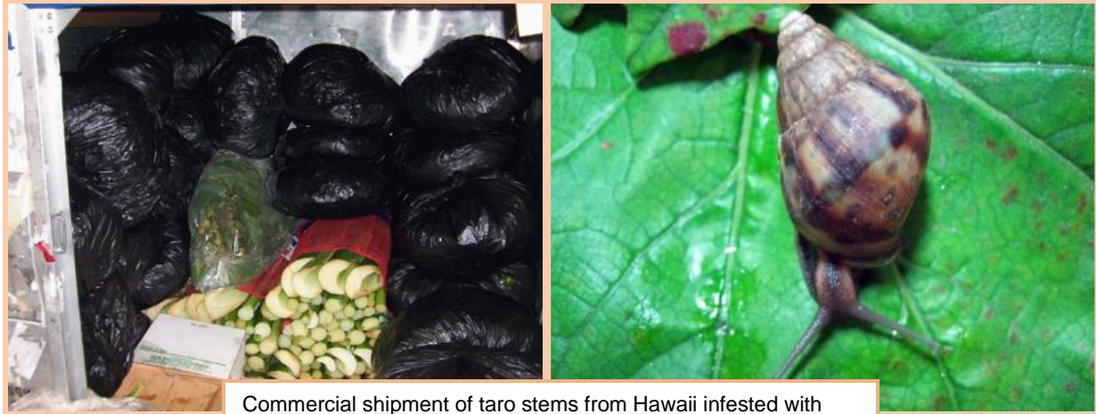
Commercial shipment of taro stems from Hawaii infested with Lissachatina fulica .

GAS US distribution map: https://pest.ceris.purdue.edu/map.php?code=IGDBABA