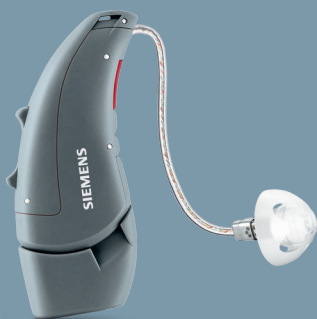
Carat A with Digital Audio Input