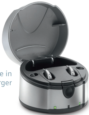
Pure in eCharger

With Pure and Carat, changing batteries is a thing of the past. Simply place your hearing aids in Siemens eCharger™ overnight. The next morning you and your hearing aids are ready to go – refreshed, dehumidified, and ready for up to 16 hours of daily use. Change batteries once a year instead of once a week.