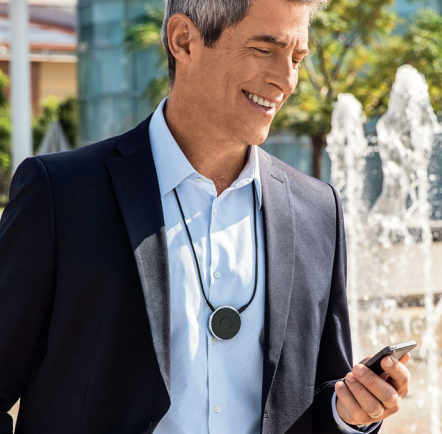
easyTek shown worn around neck