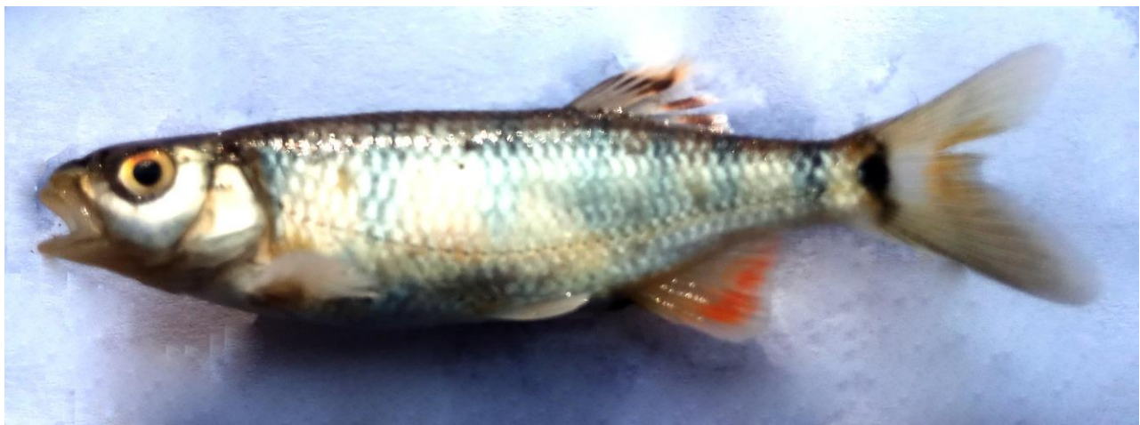
Figure 1 Opsarius kanaensis sp. nov, side view of paratype, 75/NH/MUM, 54.6mm SL