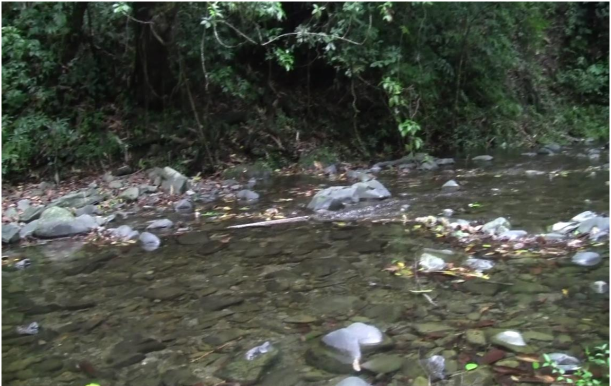
Figure 4 Kana River of Sajik-Tampak located at Chakpikarong of Chandel District, Manipur, type locality and natural habitat of Opsarius kanaensis sp. nov.

The species Opsarius kanaensis is named after the Kana River of Sajik-Tampak, located at Chakpikarong of Chandel District, Manipur.