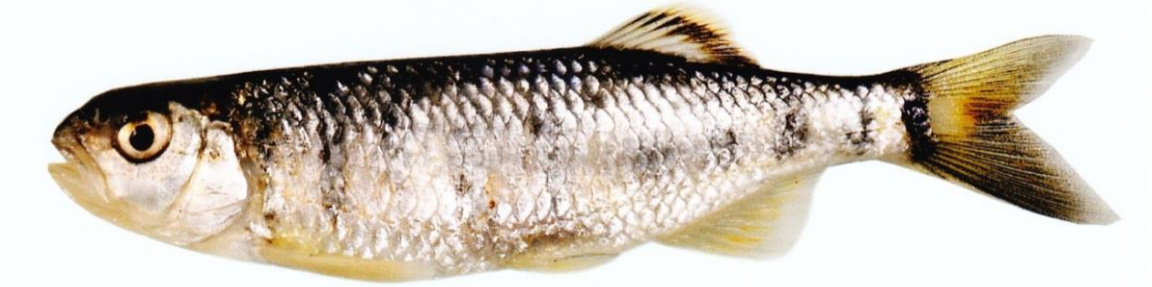
Figure 3 Opsarius kanaensis sp. nov. showing a mid-transverse black band in the dorsal-fin