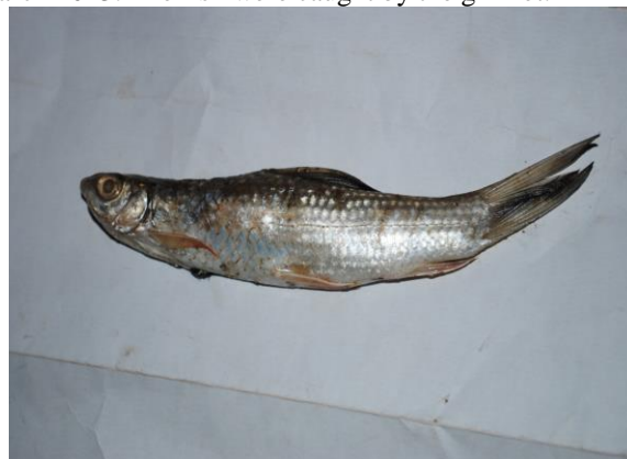
Plate 1. Labeo senegalensis from the White Volta, Yapei, Ghana

A total number of 150 Labeo senegalensis (plate 1) were collected from the landing site of the Yapei stretch from January to March 2013. The fish were caught by the gill net.