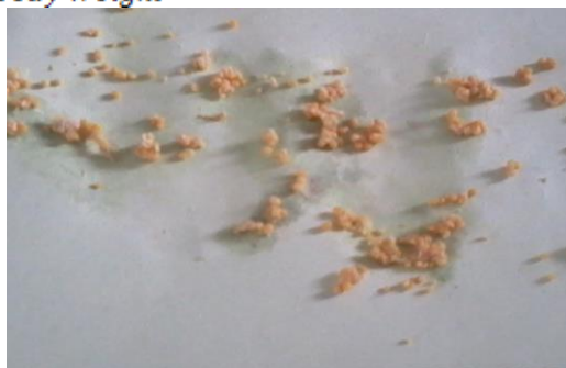
Plate 2. Eggs of Labeo senegalensis from the White Volta, Yapei, Ghana