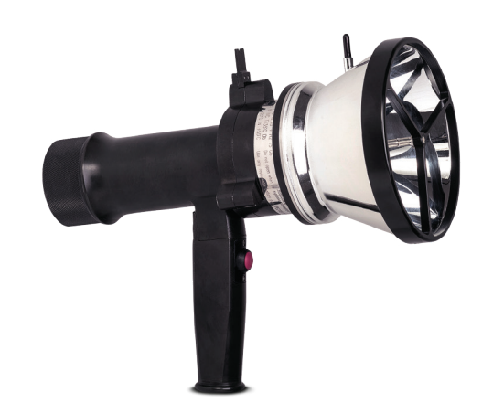
Rosemount<sup>™</sup> Flame Simulator

Therefore, by simulating a fire that actually triggers the detector outputs, the model FS-HR-975 verifies the correct operation of the Rosemount 975HR, performs an essential end-to-end loop test and verifies window cleanliness.