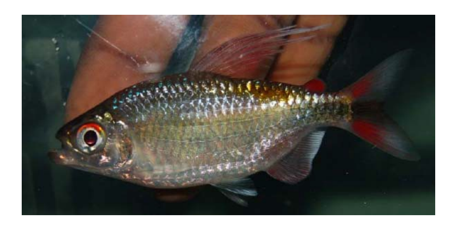
Fig.3: Brycinus sp. aff. intermedius , probably a new species, so far only known from the concession area

Fig.2: Etia nguti , a cichlid fish endemic to the vicinity of Nguti (Upper Mamfue) (Schliewen & Bitja 2013).