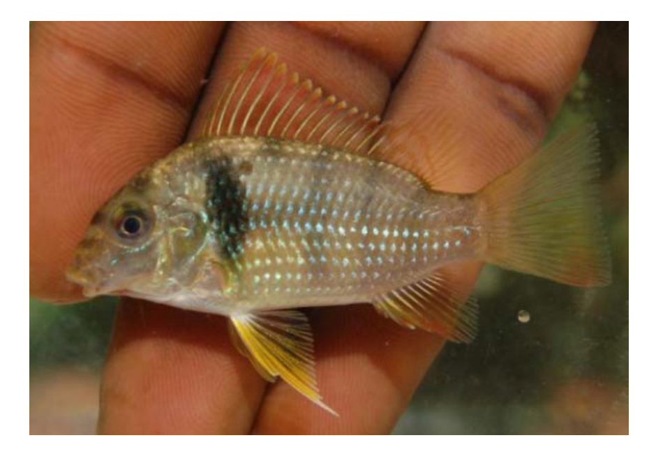
Fig.2: Etia nguti , a cichlid fish endemic to the vicinity of Nguti (Upper Mamfue) (Schliewen & Bitja 2013).

Schliewen & Bitja (2013) found the waters of the Upper Cross in the vicinity of Nguti to harbor an endemic cichlid, Etia nguti , found only in the Upper Mamfue drainage system and not anywhere else in the world. This area contains relict fish assemblages and was therefore of major importance for African fish evolution, with Etia nguti being a phylogenetic sister taxon to the majority of African cichlids. Conservation of these waters is therefore of very high conservation priority. In addition, the survey revealed the presence of a fish species probably new to science, the cyprinid Brycinus sp. aff. intermedius , so far only known from the concession area.