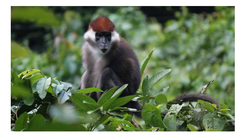
Fig. 5: The current presence of most large mammals (here a Red-capped Mangabey) in the planned concession clearly shows that the area is still quality habitat of reproductive value as well as permeable matrix between protected areas.

The records from the current surveys show indeed that the planned concession area is part of a system which stabilises the existence of all species of conservation conern of the region. They also show that presence/absence surveys of limited areas such as those usually done by EIAs need to be interpreted in a much larger context. In that sense, we strongly have to argue for a wholistic concept for both economic development and biodiversity conservation in the region.