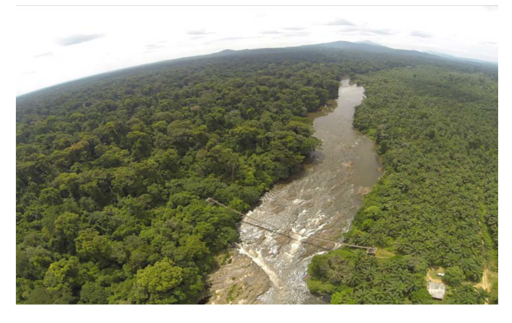
Fig. 4: Pamol Plantation (right) and Korup National Park (left), separated by the Ndian riv raiforest biodiversity, industrial oil palm plantations do neither provide habitat of any qual connectivity.