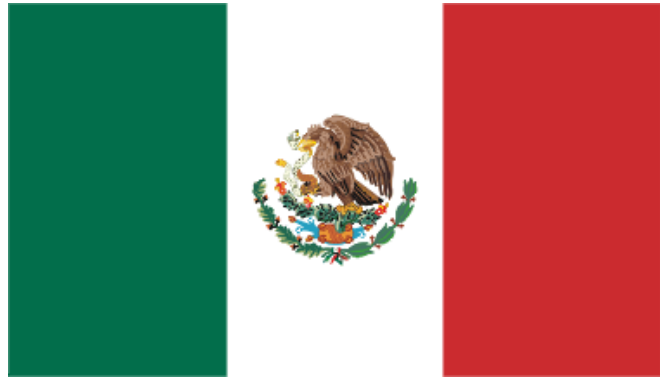
National emblem of Mexico