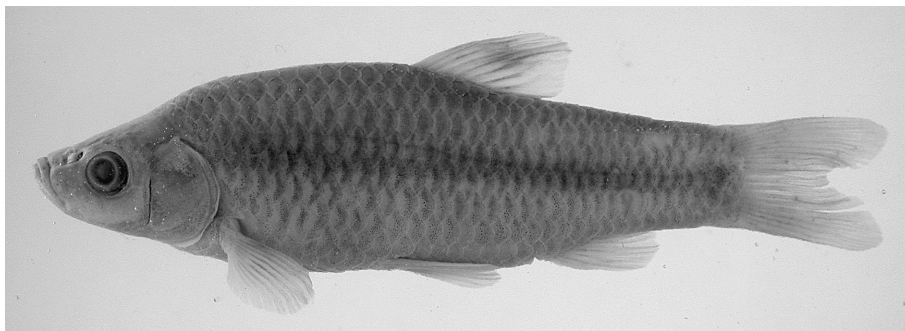
Fig. 3. Pseudorasbora pumila pumila Miyadi, 1930, collected from Shinai-numa Pond, Miyagi Prefecture, Japan (NSMT-P 73379, 6.3 cm SL).

In addition to freshwater fishes, the fish collection of Saito Ho-on Kai Museum of Natural History showed northern range extensions of the following fishes: Ophichthus altipennis (Ophichthidae, previously known as far north as Tokyo Bay), Caelorinchus anatrostris (Macrouridae, previously known as far north as Sagami Bay); Antigonia capros (Caproidae, previously known as far north as Sagami Bay); Hoplichthys gilberti