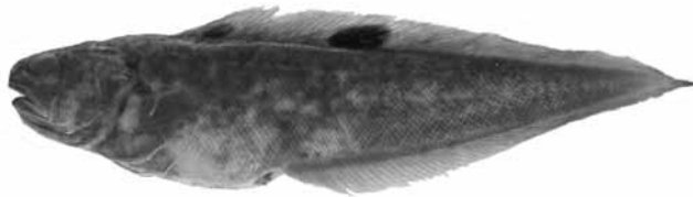
Fig. 1. Neobythites australiensis , KAUM-I. 37071, 167 mm SL, west of Okinawa Island, Japan.

The principal meristic and morphometric (expressed as percentage of SL except for the length of the longest filaments on anterior gill arch, HL) characters of the Japanese specimen are as follows: dorsal-fin rays 92; anal-fin rays 75; caudal-fin rays 8; pectoral-fin rays 26; pelvic-fin rays 2; long rakers