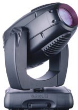
VL3000 Wash VL3000 Q Wash