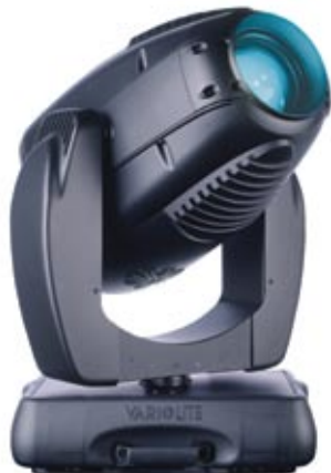
VL3000 Spot VL3000 Q Spot