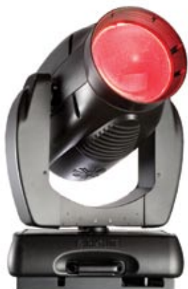
VL3500 Wash VL3500 Wash FX