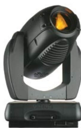
VL3500 Spot VL3500 Q Spot