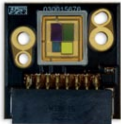
LED Chipset (Actual size)