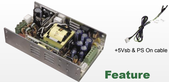
+5Vsb & PS On cable