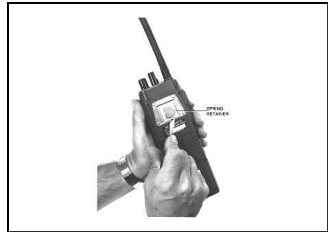
Figure 6 - Removal And Replacement Of Swivel Mount

To remove the swivel mount, slide a flat blade screwdriver underneath the spring retainer and twist. While twisting, slide the swivel mount out from under the holder.