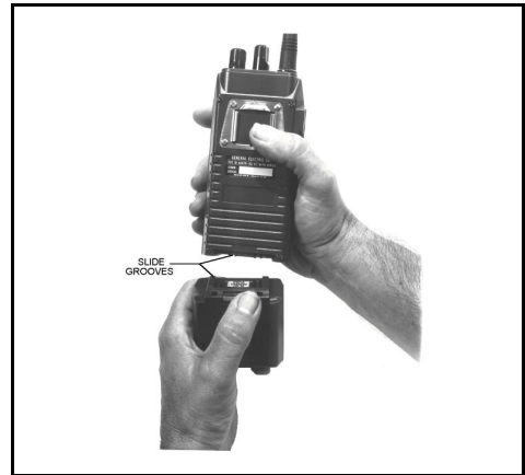
Figure 4 - Installing Battery Packs

pack out in the direction of the release latch. See Figure 5.