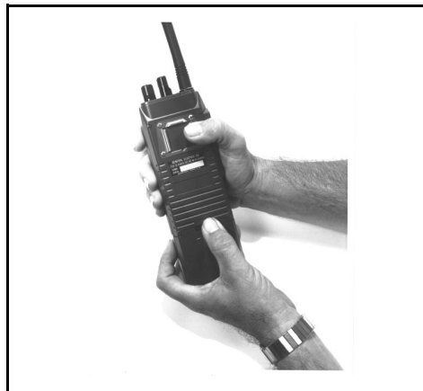
Figure 5 - Removing Battery Pack

The rechargeable batteries used with the radio can develop a reduced capacity condition sometimes called the “Memory Effect”. This condition can occur when a battery is continuously charged for long periods or when a regularly performed duty cycle allows the battery to expend only a limited portion of its capacity. The battery pack