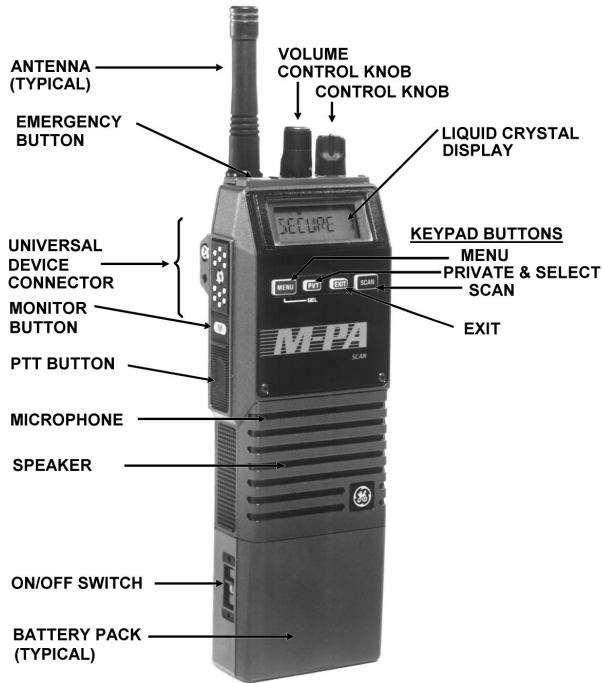
Figure 1 - M-PA Scan Model Radio