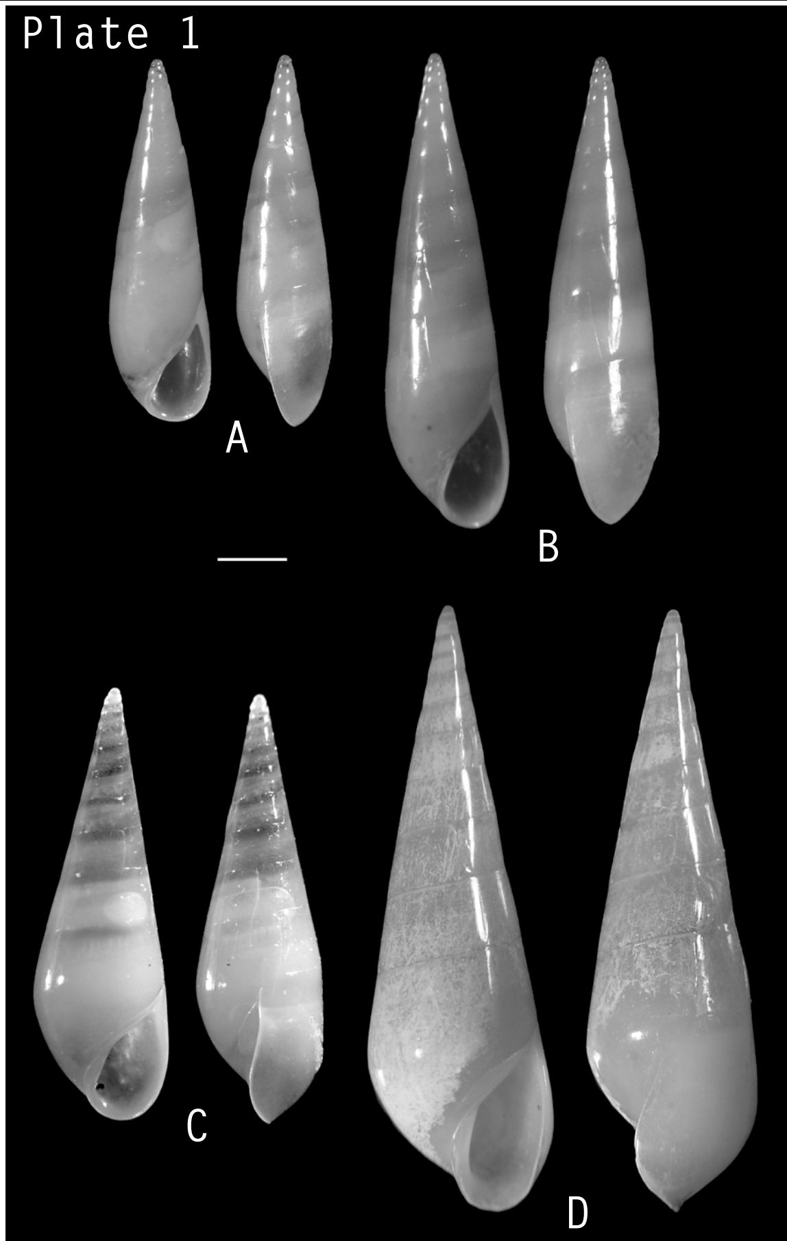
Figure A - B Melanella rosa , CSD Sta. A13(3), 5OCT92, 158 ft.; C - D Balcis micans ; C CSD Sta. 118(2), 4JAN02, 19m; D LACSD Sta. E-40, 41 m, Nov. 1997. Scale bar = 1mm