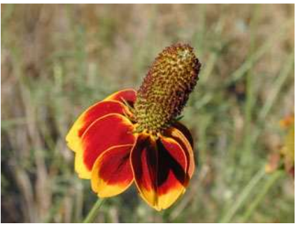
Yellow Prairie Coneflower