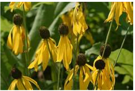
Grey-headed Prairie Coneflower