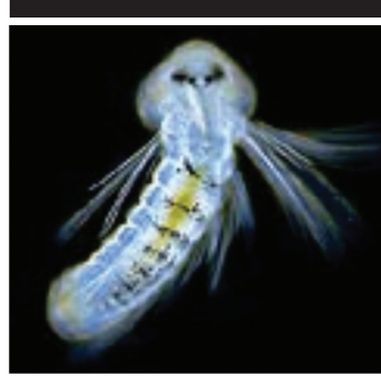
Figure 7. Polychaete larva

zooplankton—residents of the benthos that emerge into the water column, especially at night. Decapod larvae are common in the York River, especially downriver. One of the most common species of decapod larvae include the Sand Shrimp, Crangon septemspinosa , which was found to be responsible for winter peaks in decapod abundance, and there are also a number of