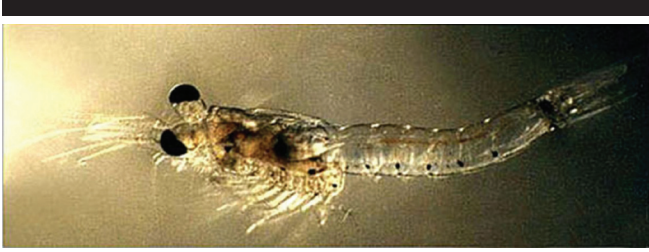
Figure 5. Mysid

(e.g., WALTER and OLNEY, 2003). We know little about mysid distribution and seasonal cycles, as most studies of plankton in the Bay have sampled only in the daytime. Amphipods are familiar to most people as the small ‘beach hoppers’ on dead algae found on the beach. Planktonic amphipods feed on dead phytoplankton or other detritus, as well as on other animals. Amphipod bodies appear compressed laterally, as opposed to the related isopods, which are flattened dorso-ventrally. Most isopods are strictly benthic, and thus they are uncommon in the plankton. There is little available information on amphipods and isopods in York River plankton, however in the adjacent lower Bay amphipods are dominated by the species Gammarus mucronatus in surface waters, and isopod densities are very low (GRANT and OLNEY, 1983).