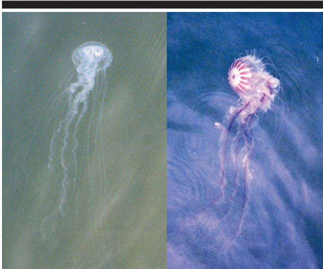
Figure 11. Sea nettle Chrysaora quinquecirrha . Two color morphs exist in the lower Chesapeake Bay, the more common white variety (left) and a less common red-striped variety (right).

Seasonal and interannual variability in medusae abundance is a function of water temperature and salinity, as well