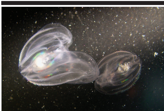
Figure 8. Ctenophore Mnemiopsis leidyi

Ctenophores or comb jellies are the largest animal to move by cilia, and have eight rows of 'combs' made of fused macrocilia that they use to swim (Figures 8 and 9). Some have tentacles loaded with sticky cells called colloblasts that are used to capture food. Others, such as the lobate ctenophores, use a pair of oral lobes coated with sticky mucus to trap prey items upon contact.