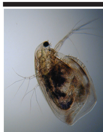
Figure 4. Cladocera Podon sp.

In the Chesapeake Bay, cladocera are most abundant in warmer months and commonly occur at the extreme geographic/ salinity ranges of the bay. Freshwater cladocera can make up >50% of the zooplankton in the freshwater tributaries of the bay (BROWNLEE and JACOBS, 1987), while other true estuarine species, such as Podon polyphemoides which peaks in May, occasionally proliferate in the lower, polyhaline portion of the bay, sometimes extending the length of the estuary (BOSCH and TAYLOR, 1967, 1973). In the tidal fresh Mattaponi tributary of the York, Bosmina is the most common genus and peaks in spring (April/May) (J. HOFFMAN, pers. comm.), while Podon peaks at the mouth of the York in July (CBP; STEINBERG and BRUSH, unpublished) (Figure 4).