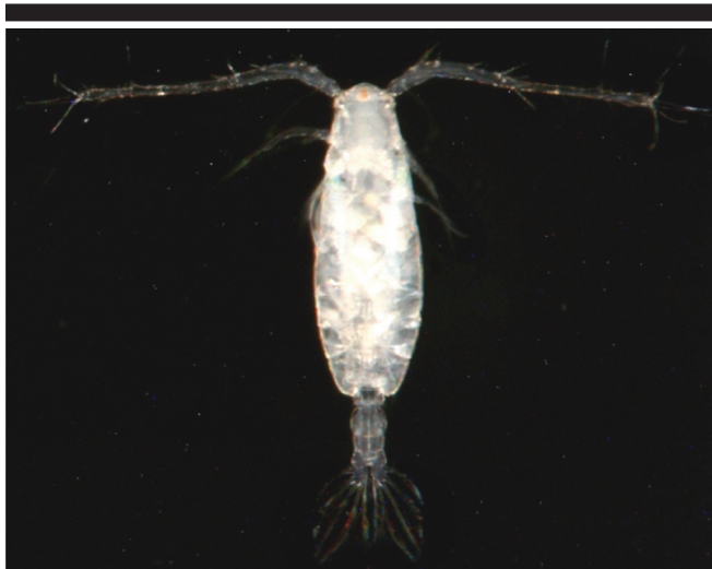
Figure 3. Copepod Acartia tonsa .

The dominant copepod species in the Chesapeake Bay are the calanoid copepods Acartia tonsa , Acartia hudsonica (formerly Acartia clausii ), and Eurytemora affinis (HEINLE, 1966, BROWNLEE and JACOBS, 1987, OLSON, 1987). In the lower polyhaline portion of the bay, the summer copepod assemblage is dominated by Acartia tonsa (Figure 3), and in winter there is a shift to Acartia hudsonica (BROWNLEE and JACOBS, 1987). In the upper mesohaline portion of the York River (station RET 4.3, CBP), Acartia spp. abundance peaks in August and Eurytemora peaks in March /April. However, while the lower York also experiences a summer Acartia bloom there is no winter Eurytemora peak (station WE 4.2, CBP; STEINBERG and BRUSH, unpublished data). This is consistent with what is found in the rest of the lower polyhaline region of the mainstem bay, where numbers of Eurytemora affinis are much reduced compared to the upper, mesohaline, mainstem bay. In the lower York, Pseudodiaptomus coronatus can also be very abundant in summer (PRICE, 1986). Acartia exhibits diel vertical migration, with densities substantially higher in the surface waters at night in the lower York