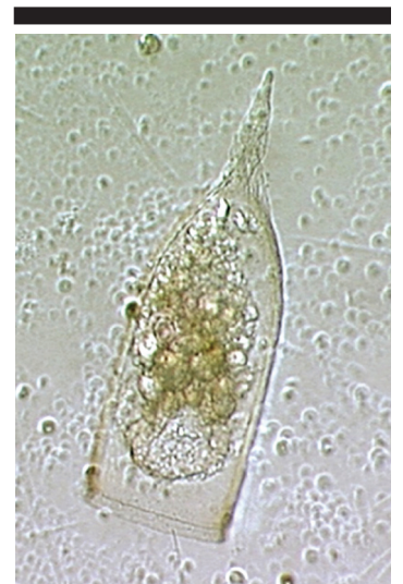
Figure 2. Tintinnid ciliate.

Microzooplankton abundance in the lower Chesapeake Bay peaks in spring (March- April) and mid-summer to early fall (July-September), and reaches a minimum in winter (Dec-Jan) (PARK and MARSHALL, 1993). This is a similar pattern seen in the rest of the Bay (BROWNLEE and JACOBS, 1987). The dominant groups of microzooplankton in the lower Bay are the ciliated protozoa (aloricate ciliates and tintinnids). Rotifers, copepod nauplii, and sarcodines are also important at times. A study of the lower Chesapeake Bay found non-loricate ciliates to represent 60%, tintinnids 33%, rotifers 4%, and nauplii larvae (mostly copepods) 3%, of the total microzooplankton composition (PARK and MARSHALL, 1993). In the York River, the abundance of each of these groups was lowest in the tidal fresh region up-river, with numbers increasing in the meso- and polyhaline regions (PARK and MARSHALL, 1993). The species diversity of tintin-