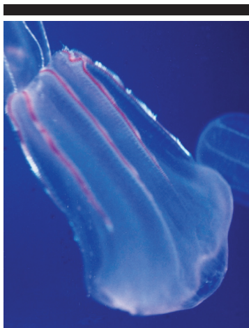
Figure 9. Ctenophore Beroë ovata

microzooplankton and small protozoans (STOECKER et al. , 1987a; SULLIVAN and GIFFORD, 2004). They have high predation rates and can drastically deplete the abundance of other planktonic species. All ctenophores are hermaphrodites and capable of self-fertilization. Sexual reproduction occurs in the water column (i.e., broadcast spawners), after which miniature (1–5 mm length) cydippid larvae form that grow rapidly into adults (>20mm length).