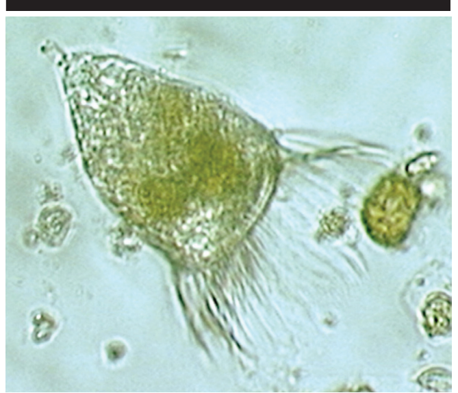
Figure 1. Ciliate Strombidium sp.

feeding. They are most common in the fresher regions of the bay, and although patchy, can be highly productive and reach high densities in some regions of the Bay (DOLAN and GALLEGOS, 1992). Other microzooplankton include the juvenile/larval stages of zooplankton such as copepods or other invertebrates.