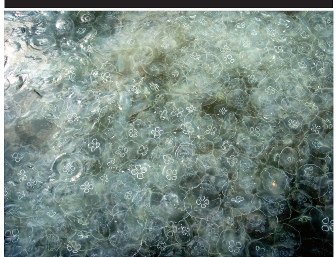
Figure 12. Moon jelly Aurelia sp. bloom in Mobjack Bay at the mouth of York River.

Another scyphomedusan abundant at times in the York River is the moon jelly, Aurelia sp. (Figure 12). Moon jellies are present in the polyhaline regions of the lower York River and Chesapeake from June–July when they can form large swarms or aggregations (CONDON and STEINBERG, 2008) (Figure 12), usually determined by local hydrographic conditions such as fronts (GRAHAM et al. , 2001). In the winter months (January–March) the Lion's Mane jellyfish, Cyanea sp., can also be found in the lower York River and Chesapeake Bay (BURRELL, 1972; CONDON and STEINBERG, 2008). This winter jelly has received little attention and consequently virtually nothing is known of the ecology and impact of Cyanea medusae in the