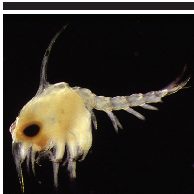
Figure 6. Decapod (crab) larva

At certain times of the year and in different salinity regimes, various meroplankton such as crab or other decapod larvae (Figure 6), bivalve (clam) and gastropod (snail) larvae, naupliar and cyprid stages of barnacles, and polychaete worm larvae (Figure 7) become numerically important in the Bay (BROWNLEE and JACOBS, 1987, OLSON, 1987, GRANT and OLNEY, 1983) and in the York River (e.g., SANDIFER, 1973). Some of these are demersal