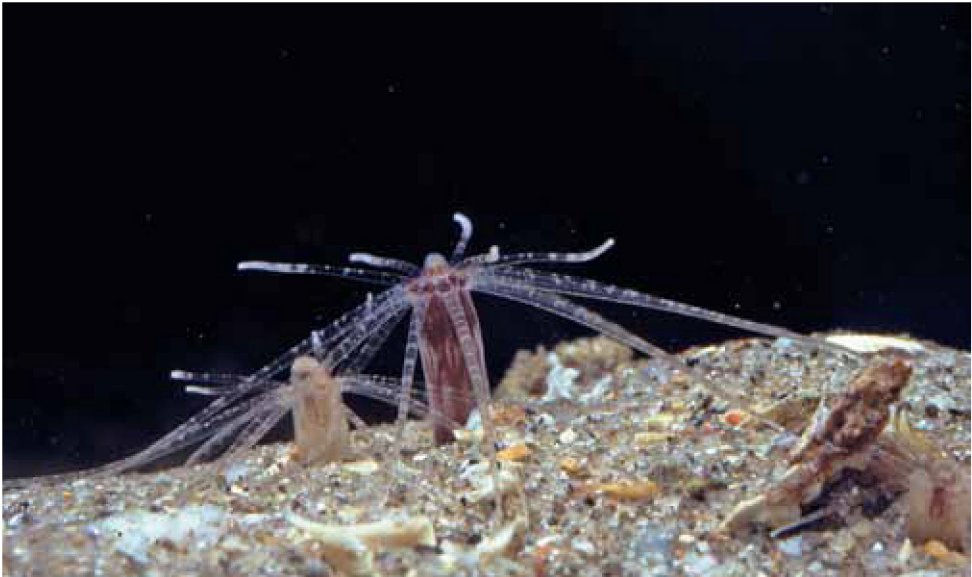
Fig. 4. Scolanthus callimorphus . Three specimens from the mudflat near Isla Tourisa, Ria de Arosa. Aquarium picture taken in January 1992.

Distribution.— According to Manuel (1981a: 268/269) Scolanthus callimorphus occurs