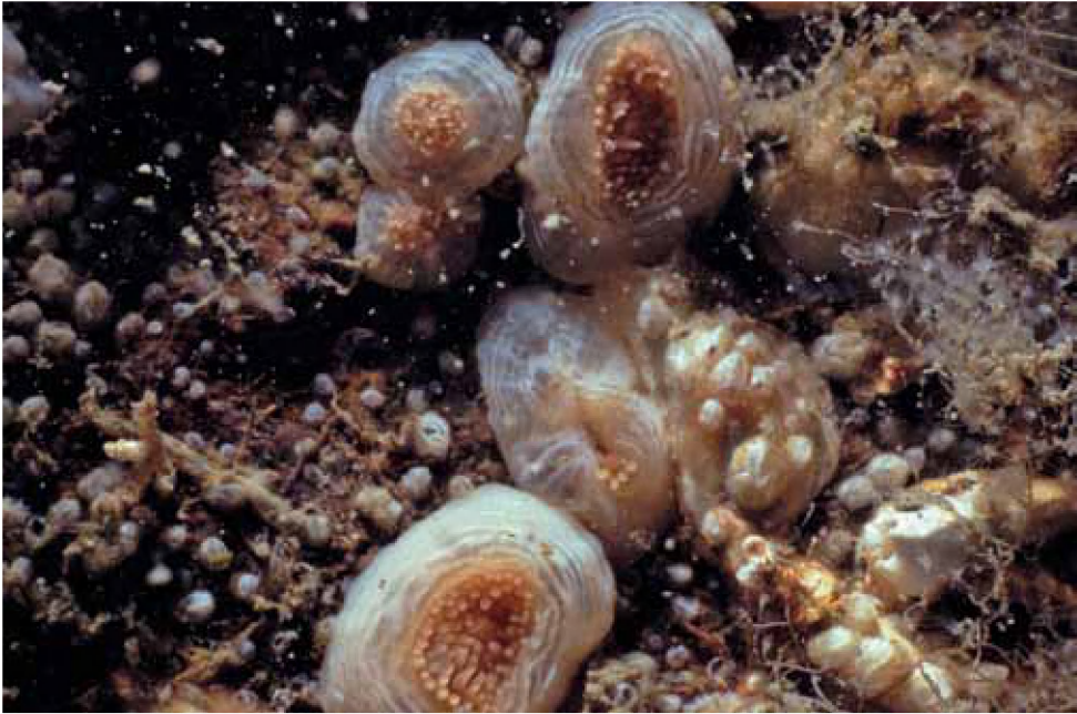
Fig. 1. Aiptasiogeton hyalinus . Several specimens with slightly contracted tentacles in the Sound of Kerrera, near Oban, western Scotland, depth about 9 m. This constitutes the first record for Scotland. In situ photograph taken on 22.v.2000