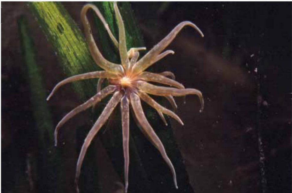
Fig. 3. Paranemonia cinerea . On leaves of Zostera sp. in the tidal channel next to Isla Tourisa. In situ photograph taken on 13.viii.1993, R.M.L. Ates.

Discussion.— This species can only be confused with small individuals of Anemonia sulcata which may likewise be found on seagrass. Small-sized live specimens of A. sulcata and P. cinerea can be distinguished by the vague cream-coloured spots on the tentacles of the latter (see fig. 3), but preserved specimens present serious difficulties. Both species are characterized by the abundant presence of zooxanthellae in the tentacular