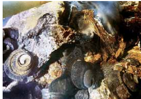
2 top: Living specimens in situ, inhabited by limpets Olgasolaris sp.; bottom: Left; right.