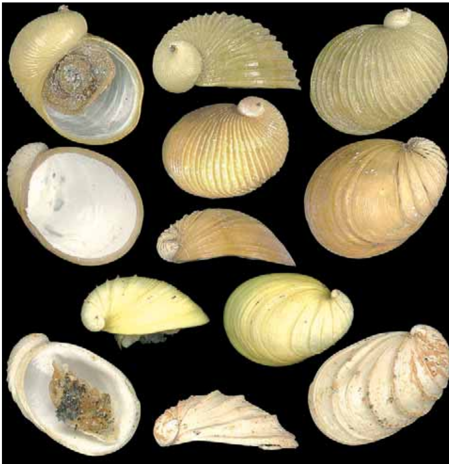
1 top: Four specimens of P. smaragdina ; by A. Le Goff © MNHN; middle: Five specimens of P. operculata ; from these the upper three specimens by A. Le Goff © MNHN and the lower two specimens with lateral and exterior view; by P. Briand © Ifremer; bottom: Three specimens of P. delicata , interior, lateral and exterior; by A. Le Goff © MNHN.

Biology: Specimens have been collected from washings of Alvinella and appear to be closely associated with active smokers. Genus endemic to vents. Larval development lecithotrophic with planktonic dispersal stage.