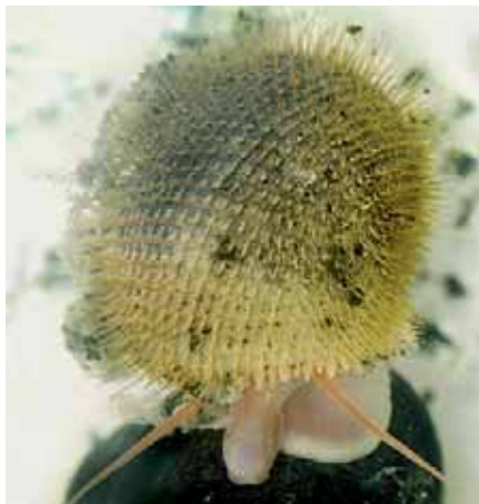
3: In situ specimen in the Lau Back-Arc Basin; Biolau cruise.