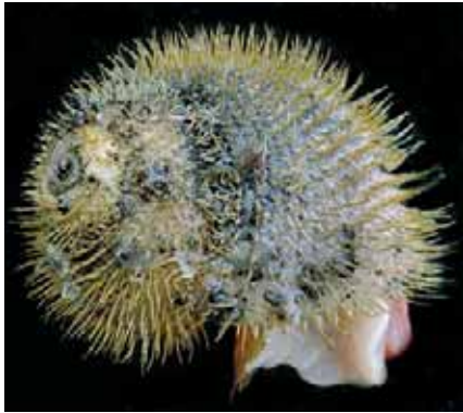
1: Apertural view; by P. Briand © Ifremer.

Distribution: A single morphospecies in the Western Pacific: Mariana, North-Fiji and Lau Back-Arc Basins; Indian Ocean: Rodriguez Triple Junction, Kairei hydrothermal field. Nevertheless, A. hessleri from the type location is genetically different from the three Alviniconcha populations collected at other places.