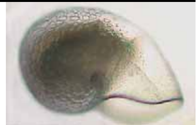
2: Larva; by courtesy of L. Mullineaux.