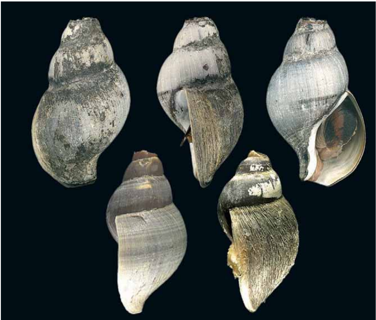
1: E. desbruyeresi ; top left to right: Abapertural, lateral and apertural view; bottom: Lateral views; by R. von Cosel & P. Lozouet.

Biology: A small radiation of buccinids living at vents; provisionally placed in the genus Eosipho , a genus known from sunken drift wood and normal bathyal environments. A related species lives at Caribbean seeps. Buccinidae are carnivorous or scavengers and E. desbruyeresi has been collected in quantity in baited traps.