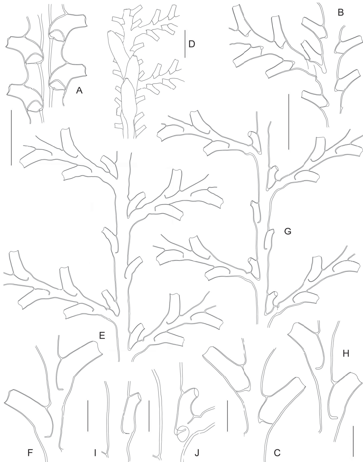
Fig. 4. — A. Gonaxia crassicaulis Vervoort, 1993 (MUSORSTOM 4, Stn. DW205), portion of cladium. — B–D. Gonaxia elegans Vervoort, 1993 (BATHUS 3, Stn. DW809). B. Portion of stem and basal part of a cladium. C. Two consecutive internodes with their hydrothecae. D. Portion of stem with male gonothecae. — E–F. Gonaxia cf. errans Vervoort, 1993 (BATHUS 2, Stn. CP737). E. Distalmost portion of stem with basal parts of four hydrocladia. F. Two consecutive cladial internodes with their hydrothecae. — G–J. Gonaxia plumularioides sp. nov. (BIOCAL, Stn. CP34). G. Distalmost part of a stem, showing the structure of internodes. H. Two consecutive cladial internodes with their hydrothecae. I. Stem hydrotheca. J. Axillar hydrotheca. Scale bars: A–B, D–E, G = 1 mm; C, F, H–J = 300 \mu m.