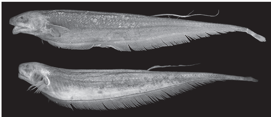
Fig. 1. ZSM 5902 (1) holotype, below ZSM 5901 (1), paratype of Aptereronotus paranaensis .

Tembeassu marauna or Aptereronotus ellisi turn out to be conspecific with Sternarchus paranaensis , then they are junior synonyms and Sternarchus paranaensis would have priority (article 23.1 ICZN). However, in his thesis de Santana (2007) treats this species valid as Aptereronotus paranaensis (Schindler, 1949), probably based on photographs and Schindler's original description he received in June 2004. Tentatively valid as Aptereronotus paranaensis (Schindler, 1949).