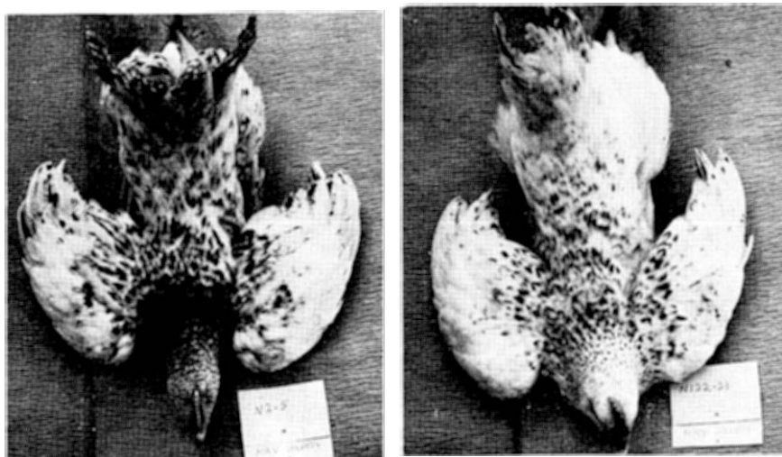
Figure 3.—Nine-week plumage color of Autosexing line (left) and Production line (right).

Warren (1953) has listed three factors which sum up the reasons for the failure of autosexing breeds to capitalize on their built-in advantage: