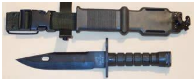
U.S. M9 BAYONET