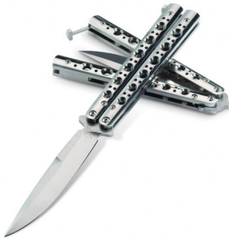
A BUTTERFLY KNIFE OPEN AND CLOSED

Butterfly knives, also known as balisongs, are sometimes named explicitly in state or local knife laws, and are sometimes considered to fall within a state or local definition of “switchblade.” A butterfly knife consists of two handle sections that, when the knife is closed, completely cover the blade.